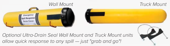
Optional Ultra-Drain Seal Wall Mount and Truck Mount units allow quick response to any spill — just “grab and go”!