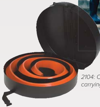
2104: Optional carrying case