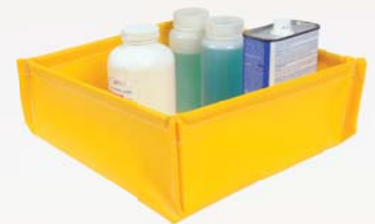
Check out the Flexible Utility Trays on page 24 for a more portable and compact solution.